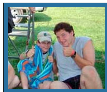
Sharing an encouraging moment during summer camp